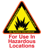
8" Explosion-Proof Electric Blower SVB-E8EXP