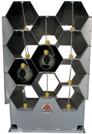
AIR-KADDY™ With Thread Savers® AK24-11TS