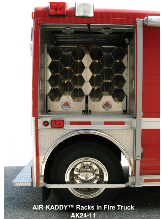
AIR-KADDY™ Racks in Fire Truck AK24-11